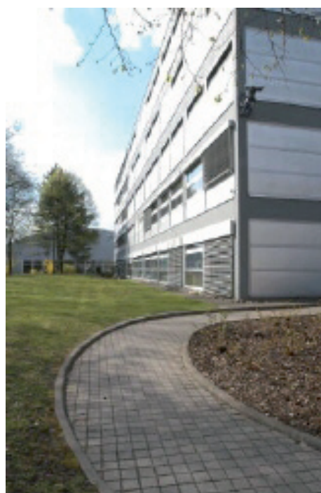
Youth Center in Strasbourg, © Council of Europe

For the purpose of coordinating the representatives elected by the YFJ and to ensure a coherent approach within the AC, the YFJ organises biannual coordination meetings. The representatives are given the opportunity to discuss issues that are on the agenda for the AC meetings and establish a common view, and to tackle the most pertinent issues. The first coordination meeting in 2009 will be held in connection with the first AC meeting in Mollina in March.