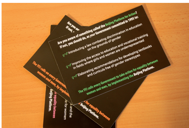
The postcards from the Beijing Platform for Action campaign

If you are interested in getting involved in these initiatives, please do not hesitate to contact the European Youth Forum at marco.perolini@youthforum.org