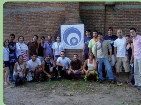
Participants at the UPC in February

The European Youth Forum was present at the 6 th Universidad de Participación Ciudadana , taking place from February 9 to February